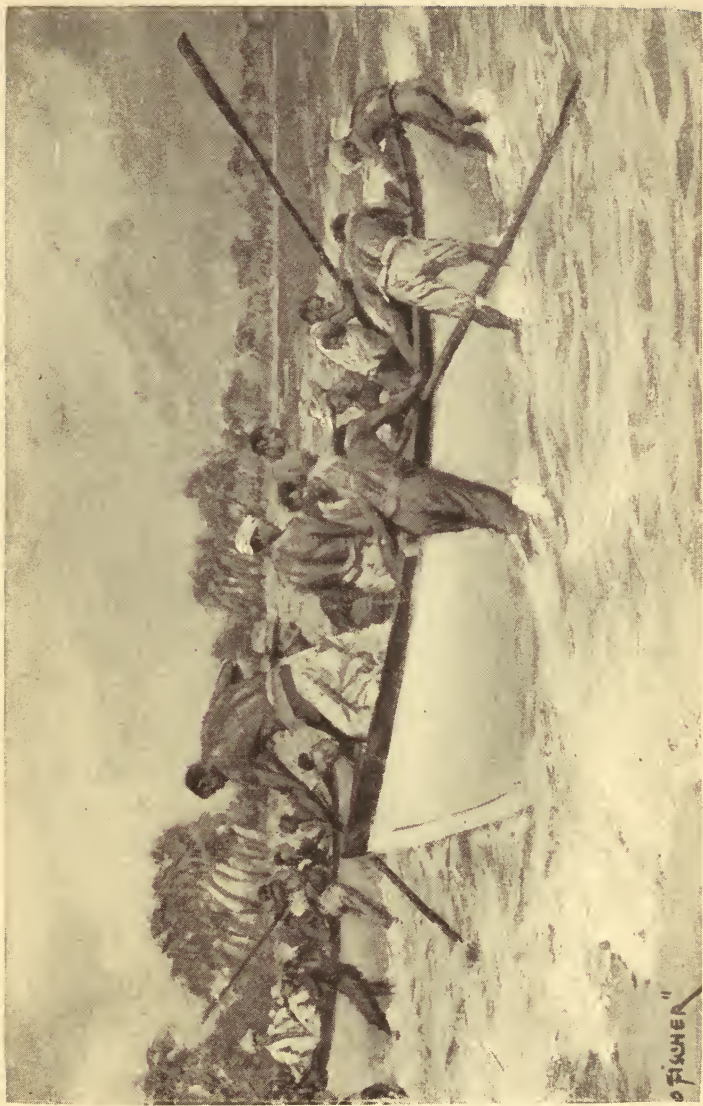
"The sand shook under their feet with each buffet of the sea on the outer shore"